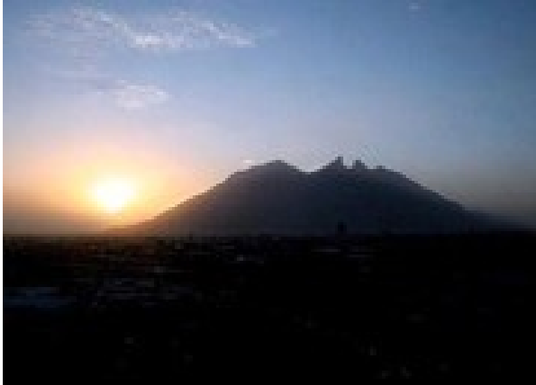
Cerro de la Silla (Saddle Mountain)

If you can attend on these dates are the first steps to consider if you would like to register to attend. If you can attend on these dates (November 5-6), please confirm back to me by email, text or phone and I will send you exact details of schedules, host hotel and travel information. We are planning on customers from around the world coming to the event and we will have a limit on the amount of people we can make arrangements for on the tours. I look forward to your quick reply.