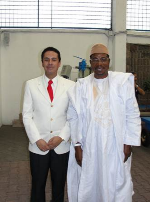
Ambassador to Nigeria to view block machinery