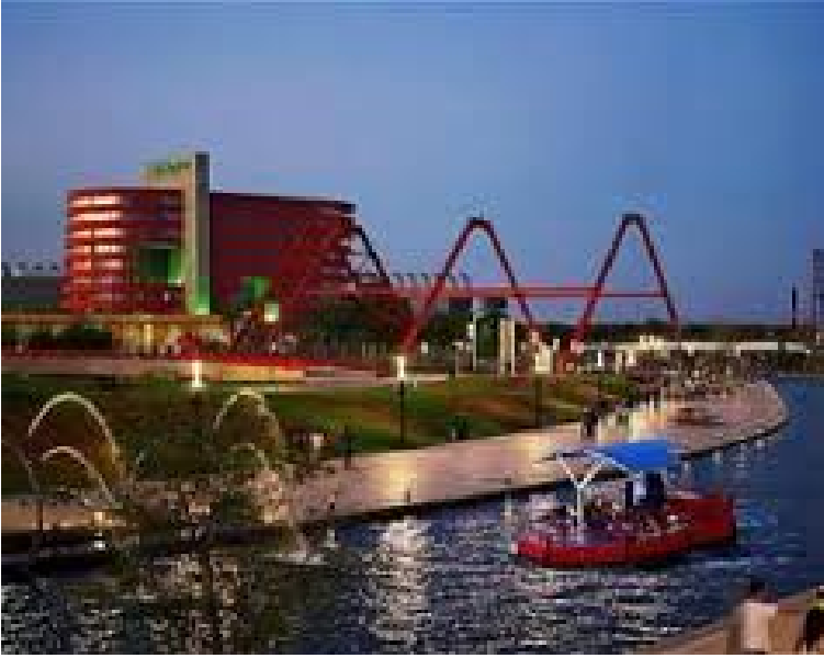
Hotel is next to Famous River Walk

All the transportation for the plant tours will be provided and all you would need from the airport is a short taxi-cab ride to the bi-lingual English and Spanish speaking luxury hotel.