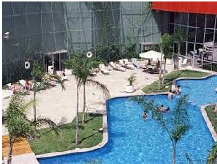
Hotel with Pool next to River Walk

All the transportation for the plant tours will be provided and all you would need from the airport is a short taxi-cab ride to the bi-lingual English and Spanish speaking luxury hotel.