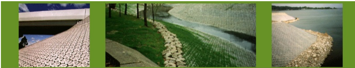
Erosion Control Products